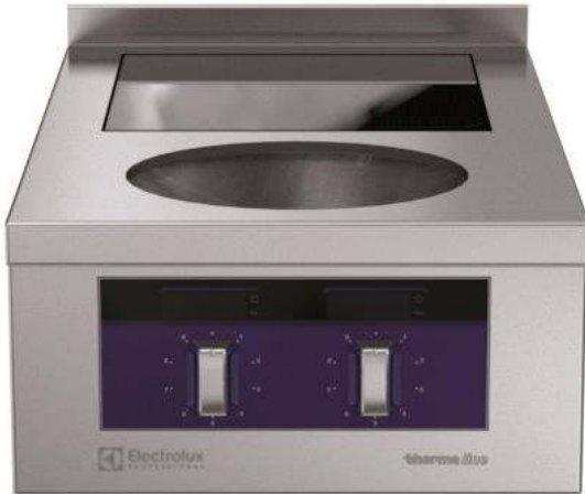
589040 (MCIJABEOAO) Induction Wok and Plate, 2 zones, one-side operated with backsplash